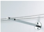
Kable Lite Outside Rigger